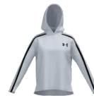
014 Halo Gray / Halo Gray / Black