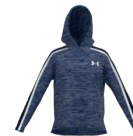
411 Midnight Navy / Cadet / White