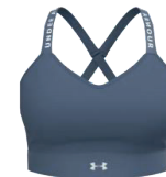
470 Mineral Blue / Mineral Blue / White