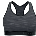
019 Charcoal Full Heather / Black / Charcoal