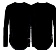
001 Black / / Iridescent