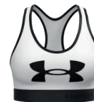
100 White / White / Black