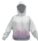
100 White / / Halo Gray