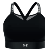
001 Black / Black / White