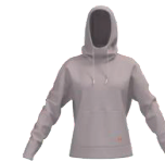
658 Beta Tint / White / Blaze Orange