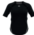
001 Black / / White