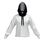
100 White / Black / Nova Blue