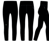
001 Black / / Iridescent