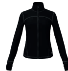
001 Black / / Black