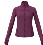
678 Pink Quartz / / Iridescent