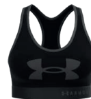
001 Black / Jet Gray / Jet Gray