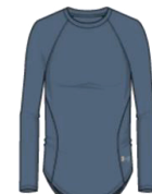
470 Mineral Blue / / Iridescent