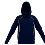
410 Midnight Navy / / White