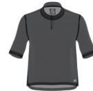
001 Black / Black / White