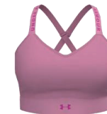
680 Planet Pink / Planet Pink / Meteor Pink