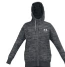
035 Steel Medium Heather / / White