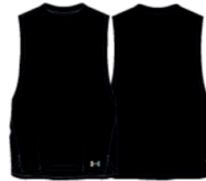
001 Black / / Iridescent