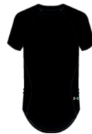
001 Black / / Iridescent