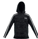
001 Black / Black / White