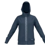
470 Mineral Blue / White / Isotope Blue