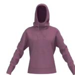
680 Planet Pink / Stellar Pink / Meteor Pink