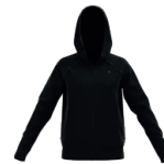
001 Black / / Black