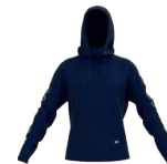
415 Regal / Hyper Green / White