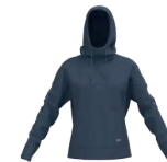
470 Mineral Blue / White / Isotope Blue