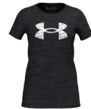
011 Jet Gray / / White