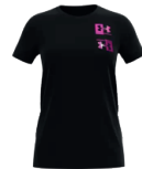
001 Black / / Meteor Pink