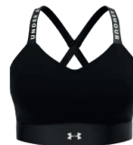
001 Black / Black / White