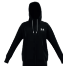
001 Black / White / White