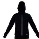
001 Black / Mod Gray / White