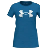
787 Brilliant Blue / / White