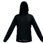
001 Black / / Black