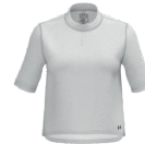
100 White / White / Black