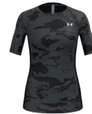
001 Black / / White