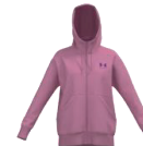
680 Planet Pink / / Pink Quartz