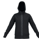
010 Jet Gray / Mod Gray / Black