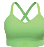
162 Summer Lime / Summer Lime / Hyper Green