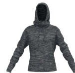
010 Jet Gray / Mod Gray / Black