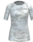
100 White / / Black