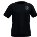
001 Black / / Nebula Purple