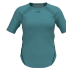
476 Cosmos / / Dark Cyan