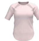
658 Beta Tint / / White