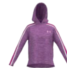
660 Meteor Pink / Planet Pink / Planet Pink