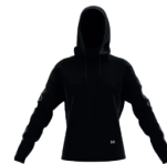
001 Black / Mod Gray / White