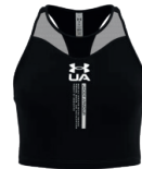
001 Black / Black / White